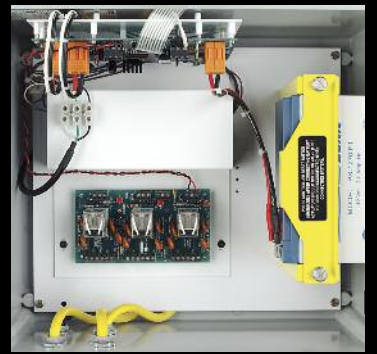
Connects Easily to Control Panel